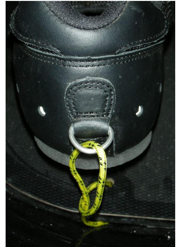
Traditional Heel Ties

It is vital that if the boat overturns that the rowers' feet pull out of their shoes. This is achieved by having ties linking the heels of the shoes to the boat, which hold the heels of the shoes down. Generally the fixing points for these ties are metal loops sewn to the shoes and these inevitably perish over time. On the 2K shoes the fixing points are part of the Heel chassis mouldings so can never fail.