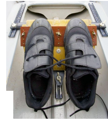
Traditional Rowing Shoes

A version is also under development for smaller boats that will adjust from US size 7-12.